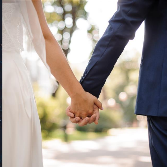
Ēros Romantic Love