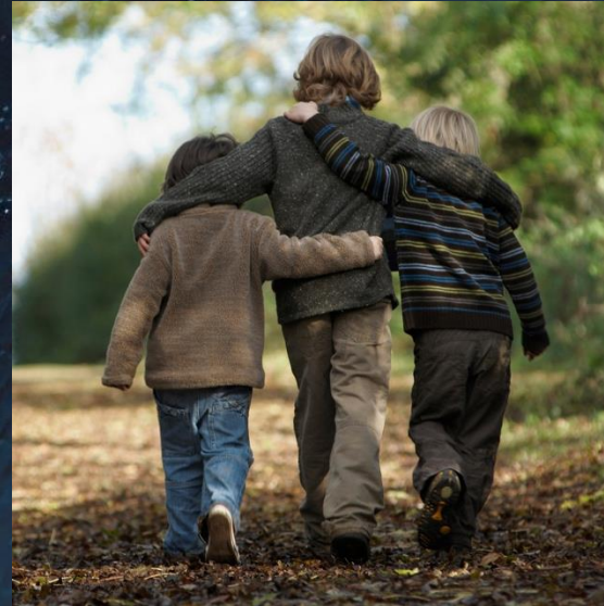
Phileo Friendship Love