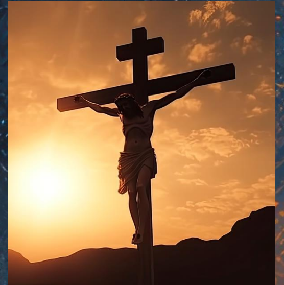
Agape God's Love