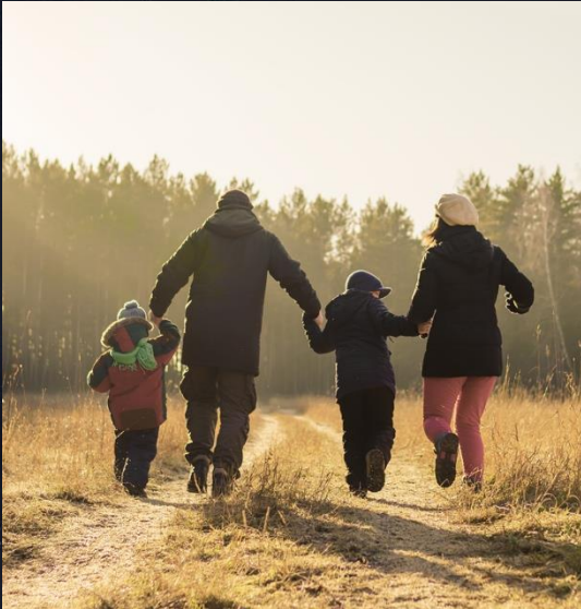
Storge Family Love